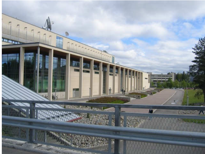
Figure 1 : Tietotalo building. The name means: "Information (tieto) building (talo)"